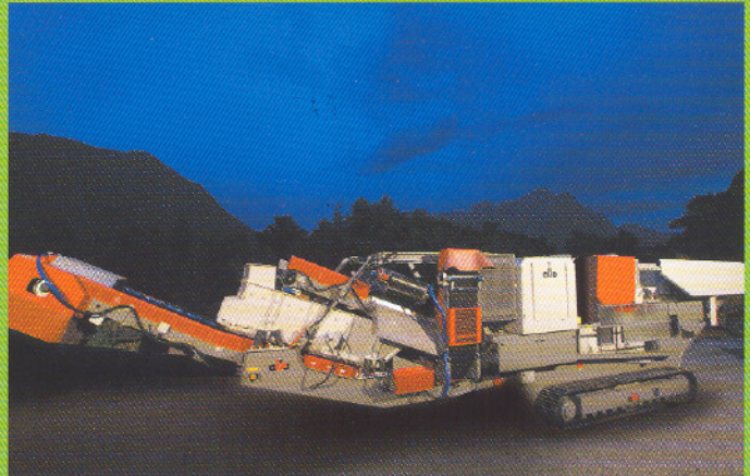
Gipo 1385 Jaw Combi – 1.3m x 0.85m Heavy Duty Primary Jaw Crusher, independent pre-screen, 5.4m 2 double deck product screen, suitable for hard rock applications and recycling of C&D waste