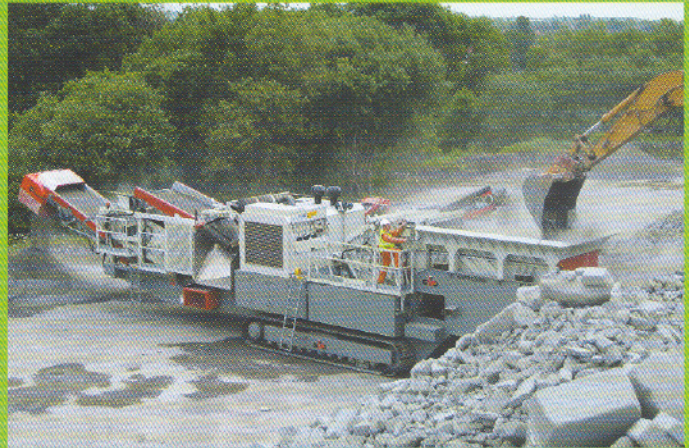
Gipo 150 Combi – 1.5m x 1.3m Primary Horizontal Impactor, 9m 2 double deck product screen, suitable for a wide range of applications including small products