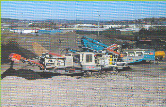
Gipomag 2700 Combi – 2.7m diameter vertical shaft impactor, 9m 2 double deck product screen, suitable for production of small and fine products from hard and abrasive materials such as spent rail ballast and gravels